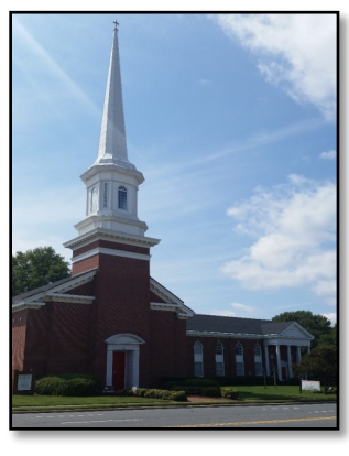
Covenant United Methodist Church